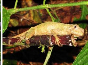
21 Plica umbra TROPIDURIDAE