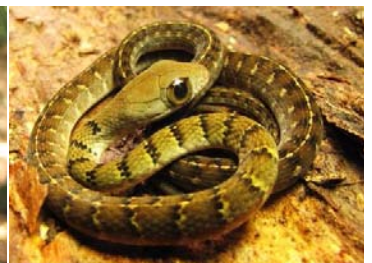
52 Dendrophidon dendrophis COLUBRIDAE