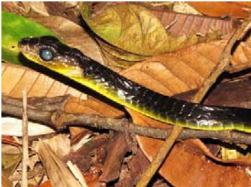
31 Chironius sp. COLUBRIDAE