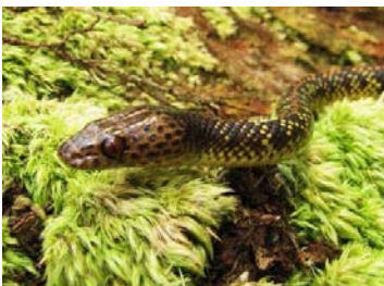
50 Siphlophis cervinus COLUBRIDAE