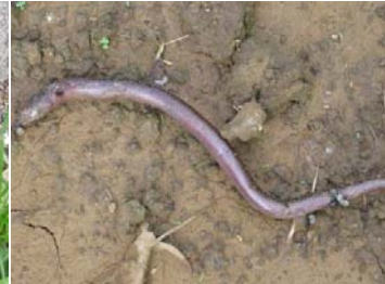
26 Unidentified LEPTOTYPHLOPIDAE