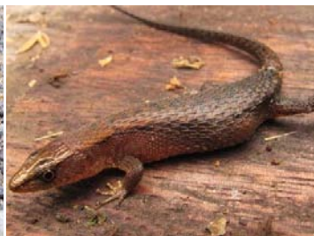
5 Alopoglossus angulatus GYMNOPHTALMIDAE