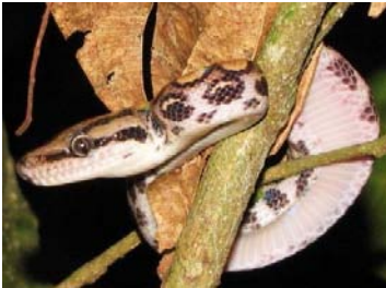
27 Epicrates cenchria cenchria BOIDAE