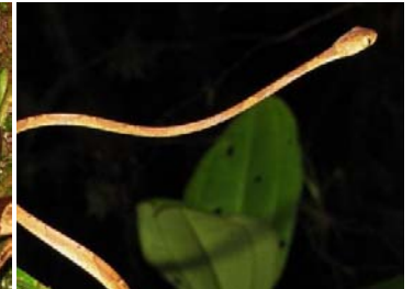
34 Imantodes lentiferus COLUBRIDAE