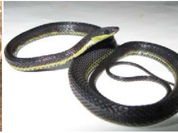
36 Synophis bicolor (photo TG) COLUBRIDAE