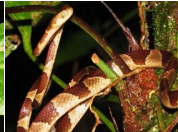
33 Imantodes cenchoa cenchoa COLUBRIDAE