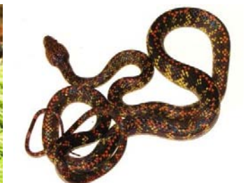
50 Siphlophis cervinus COLUBRIDAE