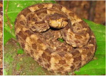
57 Bothrops atrox (Young ad.) VIPERIDAE