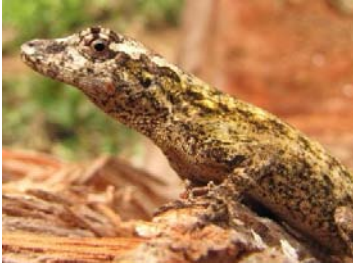
16 Anolis ortonii POLYCHROTIDAE