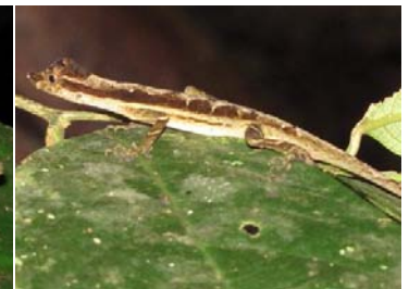
15 Anolis nitens (photo TG) POLYCHROTIDAE