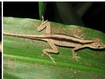
14 Anolis fuscoauratus POLYCHROTIDAE