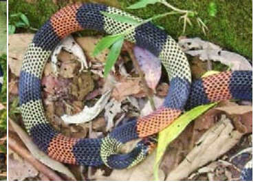
55 Micrurus spixii obscurus ELAPIDAE