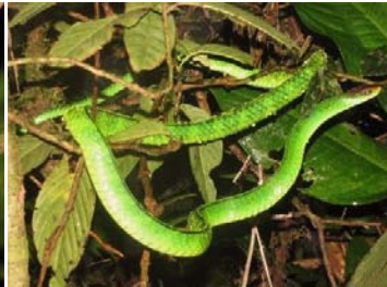
28 Chironius exoletus COLUBRIDAE