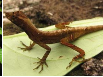
18 Anolis trachyderma POLYCHROTIDAE