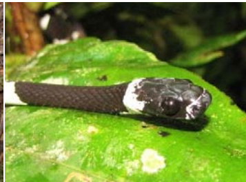
40 Dipsas catesbyi COLUBRIDAE