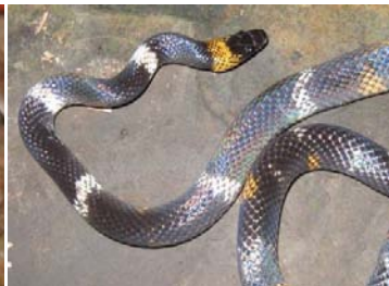
47 Oxyrhopus melanogenys (photo TG) COLUBRIDAE