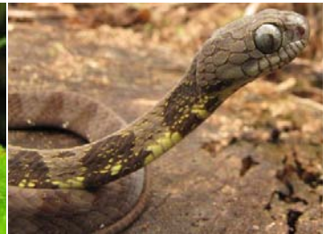
41 Dipsas indica COLUBRIDAE