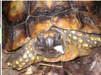
58 Geochelone denticulata (photo TG) TESTUDINIDAE