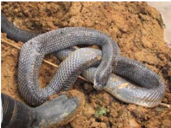
39 Clelia clelia clelia COLUBRIDAE