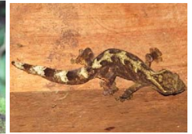
3 Thecadactylus solimoensis (photo TG) GEKKONIDAE