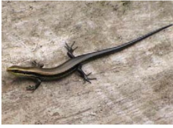
24 Mabuya altoamazonica SCINCIDAE