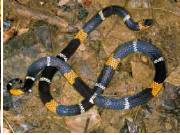
53 Micrurus hemprichii ortonii ELAPIDAE