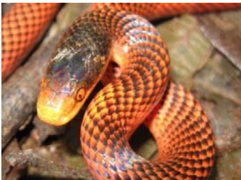
46 Oxyrhopus formosus (photo TG) COLUBRIDAE