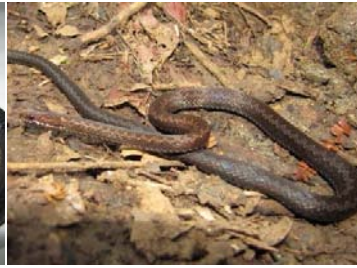
37 Taeniophallus brevirostris COLUBRIDAE