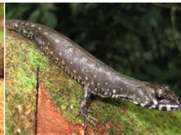
10 Potamites strangulatum GYMNOPHTALMIDAE