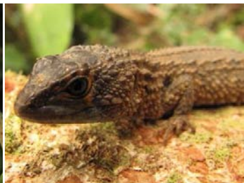
9 Potamites ecpleopus GYMNOPHTALMIDAE