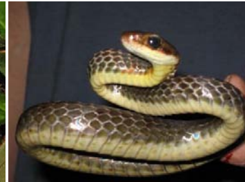
29 Chironius fuscus COLUBRIDAE