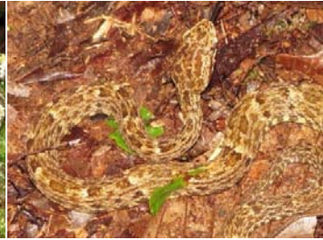
57 Bothrops atrox (Neonate) VIPERIDAE