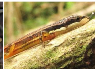
7 Cercosaura cf. oshaughnessy GYMNOPHTALMIDAE