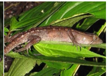
11 Potamites sp. GYMNOPHTALMIDAE