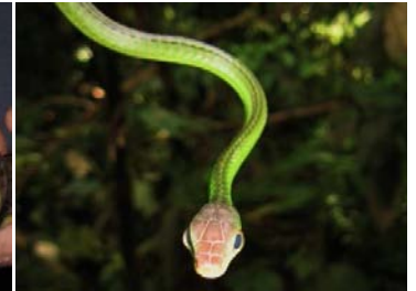
30 Chironius scurrulus COLUBRIDAE