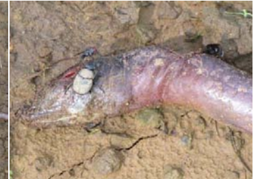
26 Unidentified LEPTOTYPHLOPIDAE