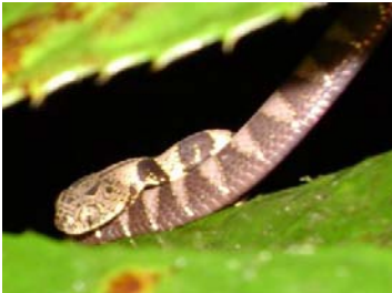
43 Dipsas indica ecuadorensis COLUBRIDAE