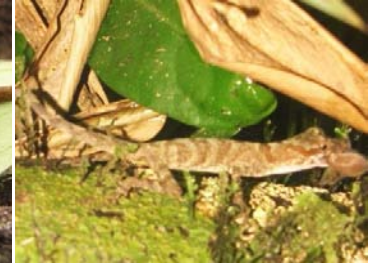
19 Anolis sp. POLYCHROTIDAE