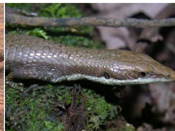
6 Anadia cf. ocellata GYMNOPHTALMIDAE