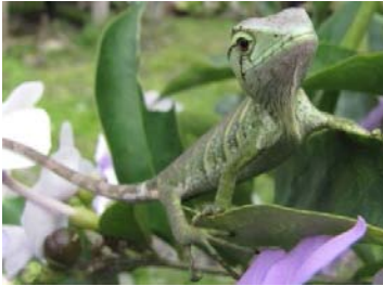
20 Polychrus marmoratus (photo TG) POLYCHROTIDAE