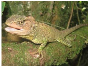
12 Enyaloides spirurus ♀ HOPLOCERCIDAE