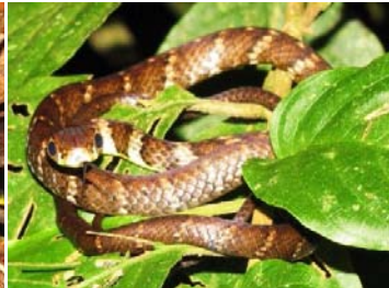
32 Drymoluber sp. COLUBRIDAE