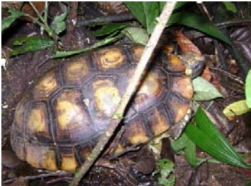
58 Geochelone denticulata TESTUDINIDAE