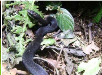
43 Liophis sp. (photo TG) COLUBRIDAE