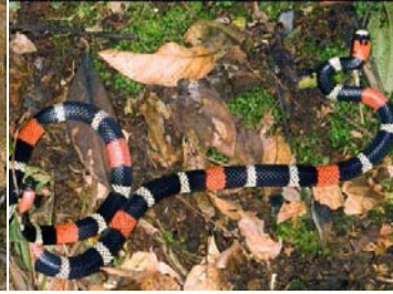
54 Micrurus lemniscatus helleri ELAPIDAE