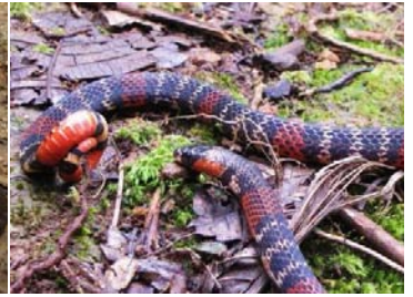
38 Atractus elaps COLUBRIDAE