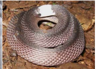
45 Ninia hudsoni COLUBRIDAE