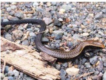
4 Iphisa elegans GYMNOPHTALMIDAE