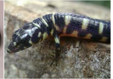
23 Unidentified ? (photo TG)