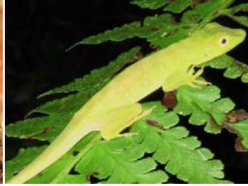
17 Anolis punctatus POLYCHROTIDAE