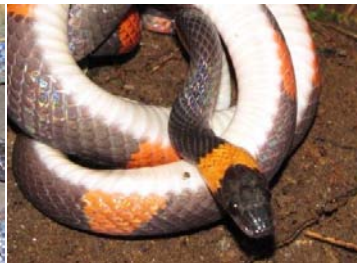
48 Oxyrhopus petola cf. digitalis COLUBRIDAE