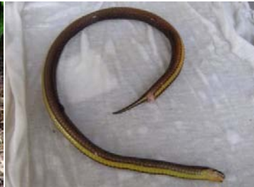
44 Ninia atrata COLUBRIDAE