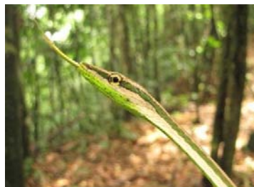
51 Xenoxobelis argenteus COLUBRIDAE