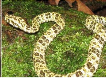
56 Bothriopsis taeniata (Subad.) (photo TG) VIPERIDAE