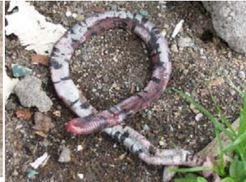
25 Amphibaesa fuliginosa AMPHISBAENIDAE