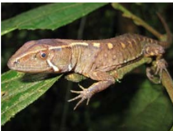
8 Potamites cochraeae GYMNOPHTALMIDAE