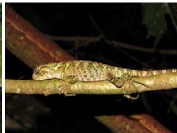
13 Enyaloides sp. HOPLOCERCIDAE