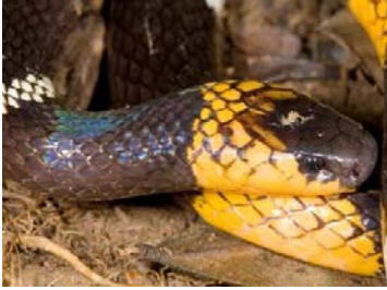
53 Micrurus hemprichii ortonii ELAPIDAE