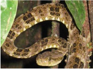
56 Bothriopsis taeniata VIPERIDAE