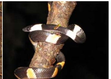
49 Oxyrhopus petola (Juv.) COLUBRIDAE