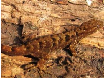
1 Gonatodes concinnatus ♀ GEKKONIDAE

© Sumac Muyu Foundation. sumacmuyu@gmail.com , http://reservadelriobigal.googlepages.com , version 1, 2011.