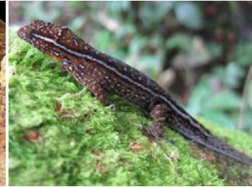
2 Lepidoblepharis cf. festae GEKKONIDAE