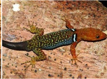
1 Gonatodes concinnatus ♂ (photo AA) GEKKONIDAE