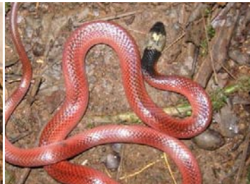
39 Clelia clelia clelia (Juv.) (photo TG) COLUBRIDAE