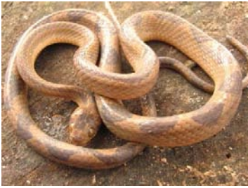
35 Leptodeira annulata annulata COLUBRIDAE