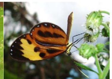
11 Ceratinia tutia poecila (photo TG) ITHOMIINI