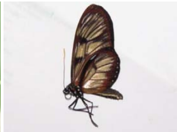
23 Eutresis hyperereia bonosana MELINAEINI