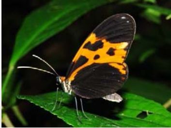
19 Mechanitis messenoides deceptus MECHANITINI