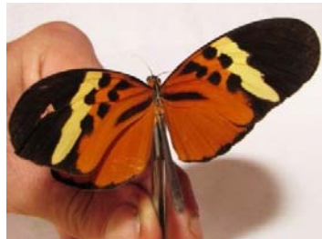
25 Melinaea menophilus zaneka (photo TG) MELINAEINI