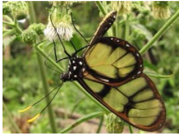
1 Dircenna dero (photo TG) DIRCENNINI

© Sumac Muyu Foundation. sumacmuyu@gmail.com , http://reservadelriobigal.googlepages.com , version 1, 2011.