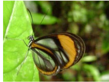
3 Brevioleria arzalia new ssp. (photo TG) GODYRIDINI