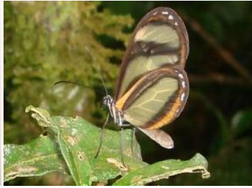
14 Pteronymia primula ITHOMIINI