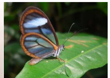
13 Pseudoscada timna timna ITHOMIINI