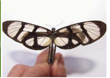
15 Thyridia psidii (photo TG) ITHOMIINI