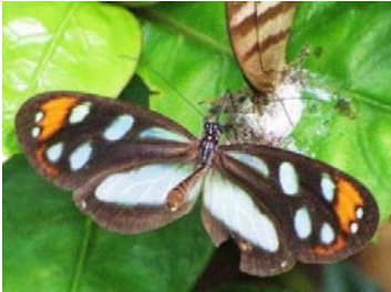
28 Hyoscada illinissa ida (photo MH) OLERIINI