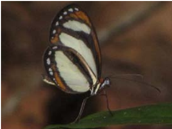
32 Aeria eurimedia negricola TITHOREINI