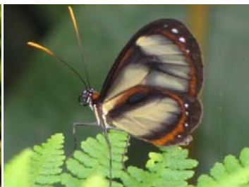
9 Ithomia salapia salapia GODYRIDINI