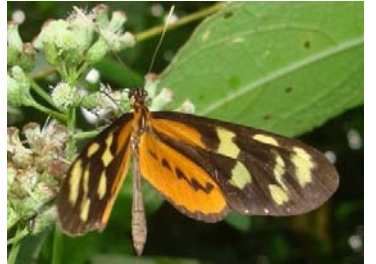
17 Mechanitis lysimnia elisa MECHANITINI