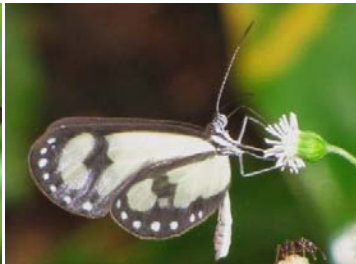
22 Scada zibia quotidiana MECHANITINI