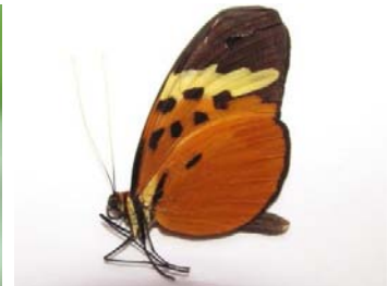
25 Melinaea menophilus zaneka MELINAEINI