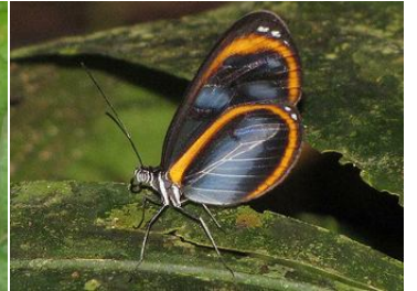
30 Oleria ileridina lerida OLERIINI