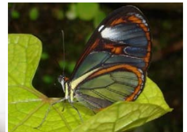
7 Ithomia agnosia (photo TG) GODYRIDINI