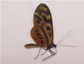
16 Forbestra olivencia juntana MECHANITINI