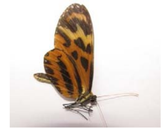
18 Mechanitis mazaesus (photo TG) MECHANITINI