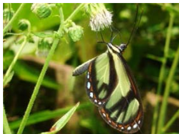
8 Ithomia salapia derasa GODYRIDINI