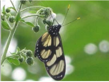
15 Thyridia psidii ITHOMIINI