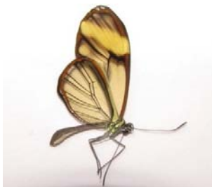
5 Greta libethris GODYRIDINI