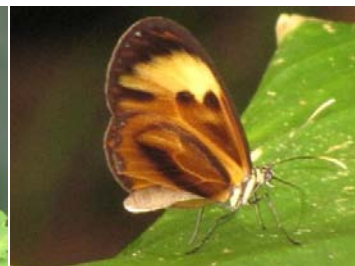
10 Ceratinia neso espriella ITHOMIINI