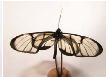
23 Eutresis hyperereia bonosana MELINAEINI