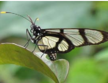
21 Methona confusa MECHANITINI