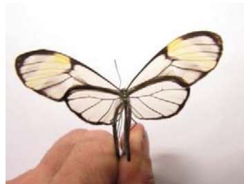
5 Greta libethris GODYRIDINI