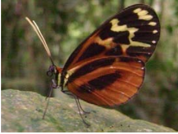
27 Hypothyris semifulva satura NAPEOGENINI