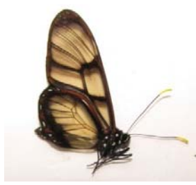
2 Dircenna loreta DIRCENNINI