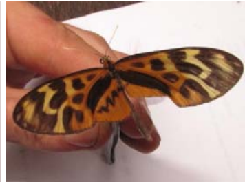
16 Forbestra olivencia juntana (photo TG) MECHANITINI