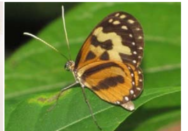
26 Hypothyris euclea intermedia NAPEOGENINI