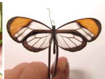
12 Pseudoscada florula aureola ITHOMIINI