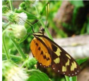
17 Mechanitis lysimnia elisa MECHANITINI