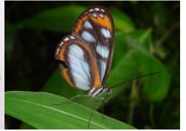
28 Hyoscada illinissa ida OLERIINI