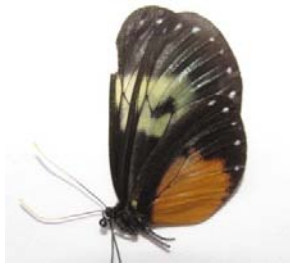
33 Hyalyris coeno norellana NAPEOGENINI