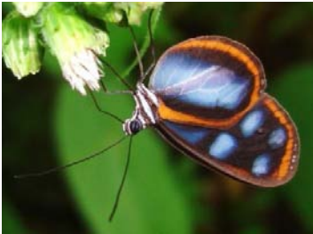
31 Oleria onega OLERIINI