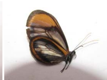
6 Hypoleria lavinia chrysodonia (photo TG) GODYRIDINI