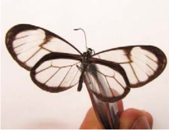
13 Pseudoscada timna timna ITHOMIINI