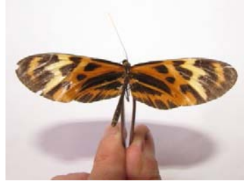
18 Mechanitis mazaesus MECHANITINI