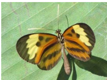
11 Ceratinia tutia poecila ITHOMIINI