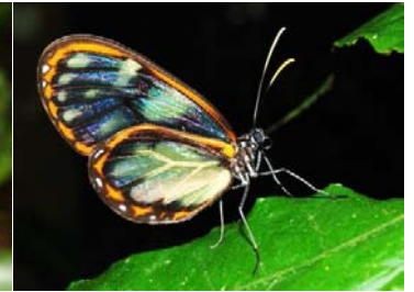
4 Godyris zavaleta matronalis GODYRIDINI