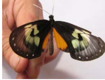
33 Hyalyris coeno norellana NAPEOGENINI