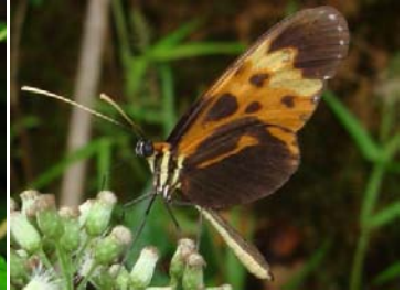
20 Mechanitis messenoides messenoides MECHANITINI