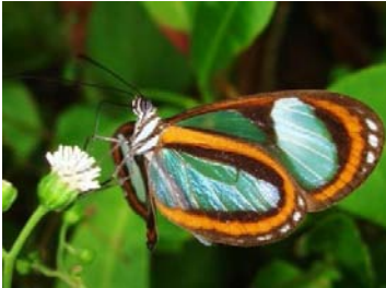
29 Oleria estella OLERIINI