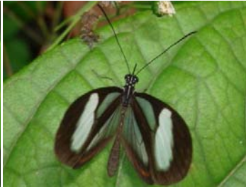
29 Oleria estella OLERIINI