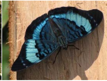
27 Panacea cf. procilla BIBLIDINI