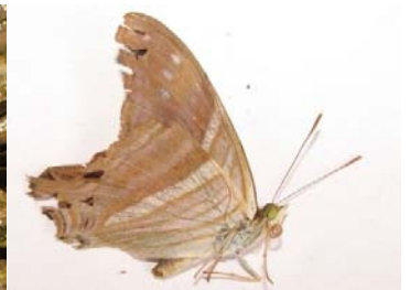
36 Marpesia chiron ♂ (photo TG) CYRESTINI