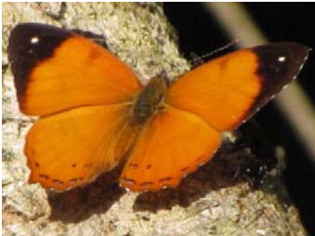
43 Nica flavilla EIPPHILINI