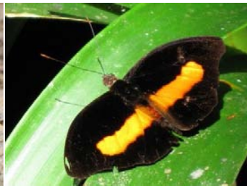
10 Catonephele acontius BIBLIDINI