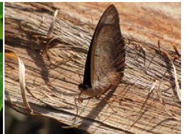
11 Catonephele numilia BIBLIDINI