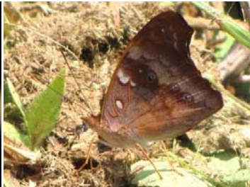
44 Temenis laothoe EIPPHILINI