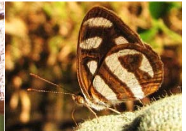
19 Dynamine artemisia glauce (photo TG) BIBLIDINI