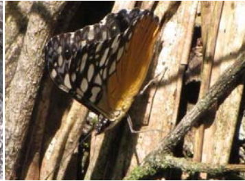
2 Hamadryas sp. AGERONIINI