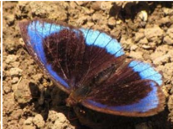
22 Eunica Alcmena BIBLIDINI