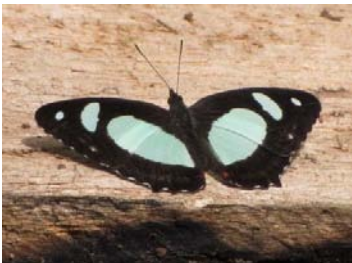
34 Pyrrhogyra otolais BIBLIDINI