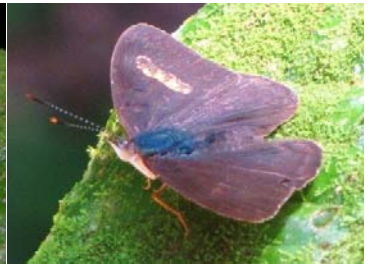
31 Peria lamis BIBLIDINI