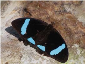
26 Nessaea hewitsonii (photo TG) BIBLIDINI