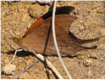
38 Marpesia furcula ♀ CYRESTINI