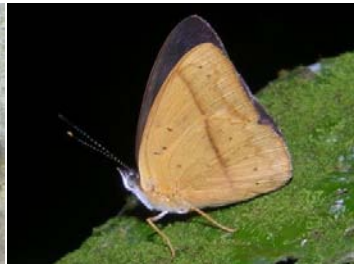
31 Peria lamis BIBLIDINI