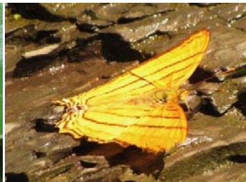
35 Marpesia berania ♂ CYRESTINI