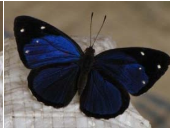
20 Dynamine gisella BIBLIDINI