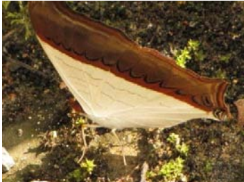
41 Marpesia zerynthia CYRESTINI