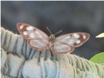
19 Dynamine artemisia glauce BIBLIDINI