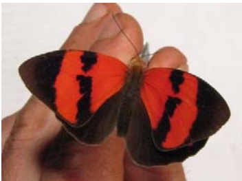
45 Temenis pulchra pallidior ♂ (photo TG) EIPPHILINI