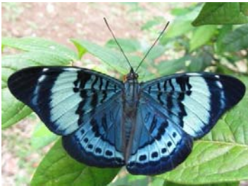
29 Panacea cf. regina II BIBLIDINI