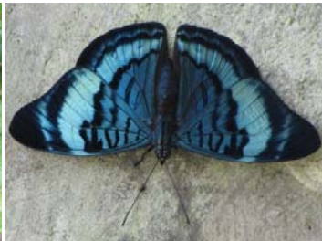
30 Panacea procilla divalis BIBLIDINI