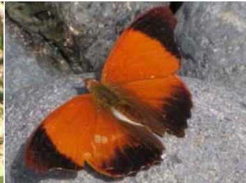
44 Temenis laothoe (photo TG) EIPPHILINI