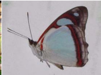
33 Pyrrhogyra edocla BIBLIDINI