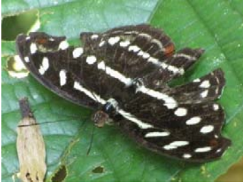
14 Catonephele salambria ♀ BIBLIDINI