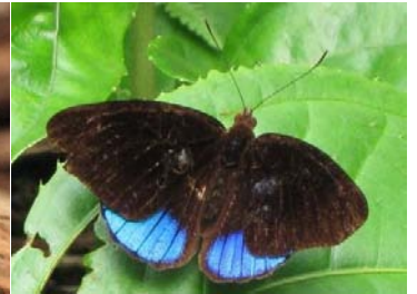
23 Eunica norica BIBLIDINI