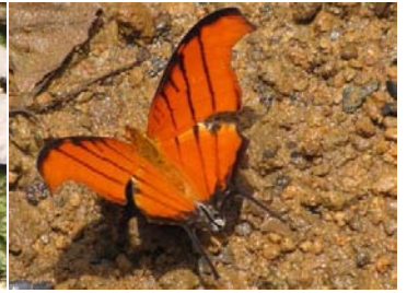
40 Marpesia petreus CYRESTINI