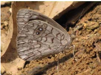
24 Eunica veronica BIBLIDINI