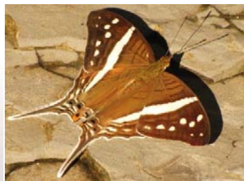
37 Marpesia crethon CYRESTINI