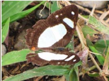
32 Pyrrhogyra amphiro BIBLIDINI