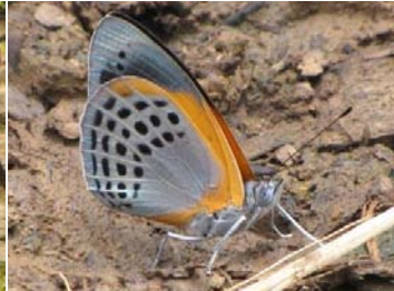
42 Asterope markii EIPPHILINI