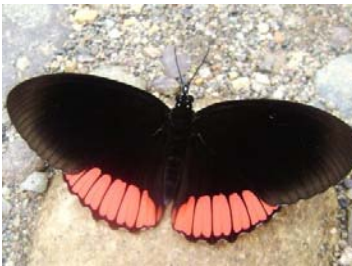
4 Biblis hyperia BIBLIDINI