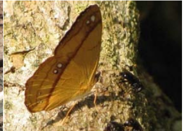
43 Nica flavilla EIPPHILINI