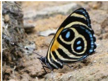
9 Callicore Tolima BIBLIDINI