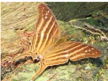
36 Marpesia chiron (photo TG) CYRESTINI