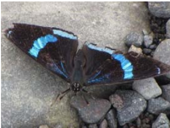
16 Diaethria clymena BIBLIDINI