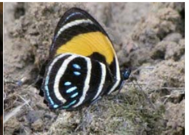
7 Callicore lyca salamis BIBLIDINI