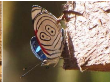
18 Diaethria Euclides BIBLIDINI