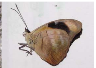
14 Catonephele salambria BIBLIDINI