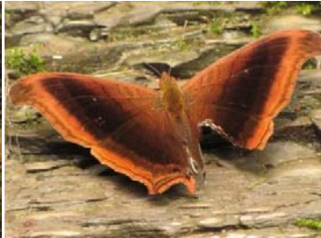
41 Marpesia zerynthia CYRESTINI