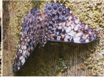
2 Hamadryas sp. AGERONIINI