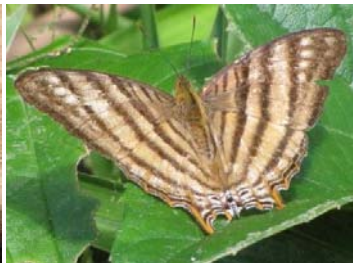
35 Marpesia berania ♀ CYRESTINI