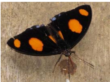
11 Catonephele numilia BIBLIDINI