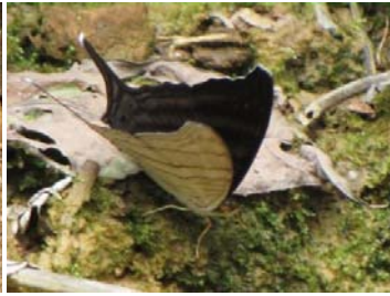
39 Marpesia livius CYRESTINI