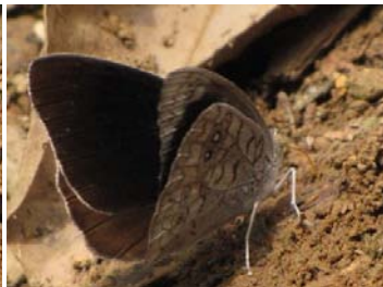
24 Eunica veronica BIBLIDINI