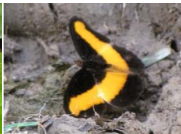
13 Catonephele salacia ♂ BIBLIDINI