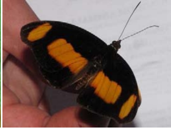
14 Catonephele salambria ♂ BIBLIDINI