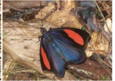
3 Batesia hypochlora BIBLIDINI