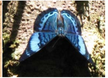
28 Panacea cf. regina I BIBLIDINI