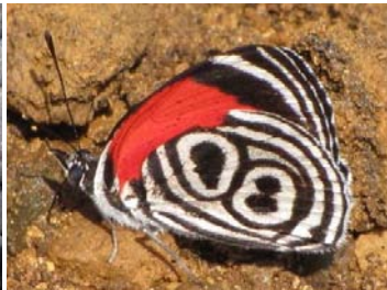
17 Diaethria clymena bourcierii BIBLIDINI