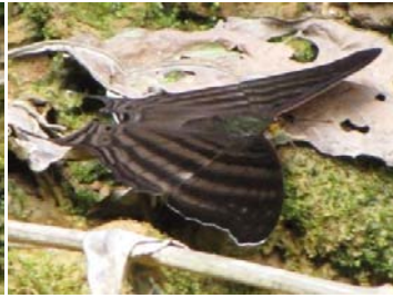
39 Marpesia livius CYRESTINI