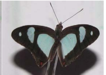
33 Pyrrhogyra edocla BIBLIDINI