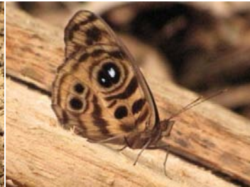
23 Eunica norica BIBLIDINI