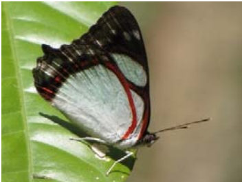
32 Pyrrhogyra amphiro BIBLIDINI