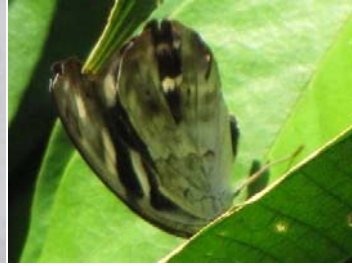
15 Catonephele sp. BIBLIDINI