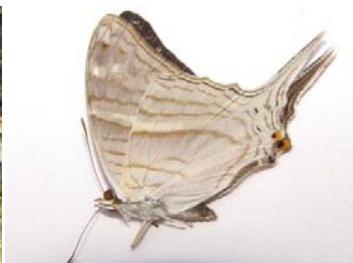
37 Marpesia crethon CYRESTINI