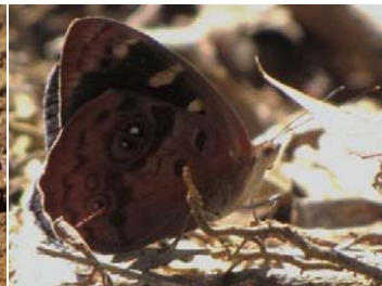
25 Eunica sp. BIBLIDINI