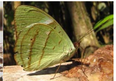
26 Nessaea hewitsonii BIBLIDINI