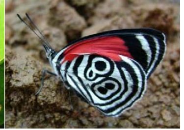
16 Diaethria clymena BIBLIDINI