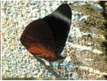
27 Panacea cf. procilla (photo TG) BIBLIDINI