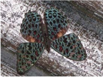
1 Hamadryas chloe (photo TG) AGERONIINI

© Sumac Muyu Foundation. sumacmuyu@gmail.com , http://reservadelriobigal.googlepages.com , version 1, 2011.