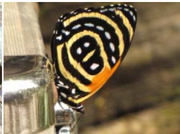
5 Callicore cynosura cynosura BIBLIDINI