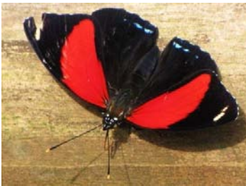
8 Callicore pygas ssp. BIBLIDINI