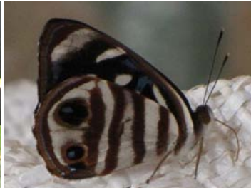
20 Dynamine gisella BIBLIDINI