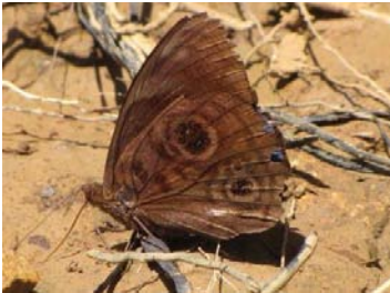
22 Eunica Alcmena BIBLIDINI