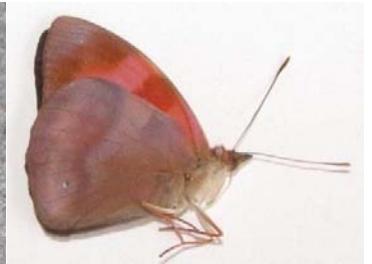
45 Temenis pulchra pallidior ♂ EIPPHILINI