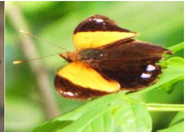
21 Epiphile lampethusa BIBLIDINI