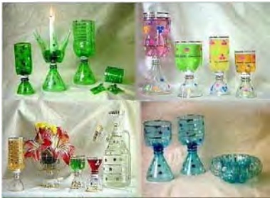
Use old bottles ... for festive tables!