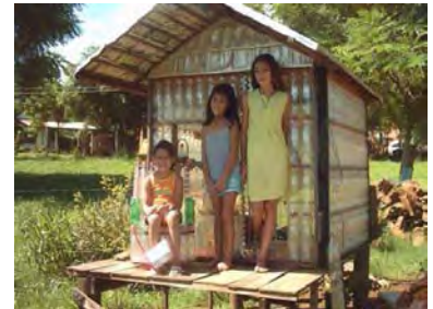
Use old bottles ... for cute shelters!