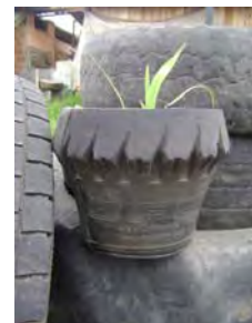
Use old tires ... for atypical pots!