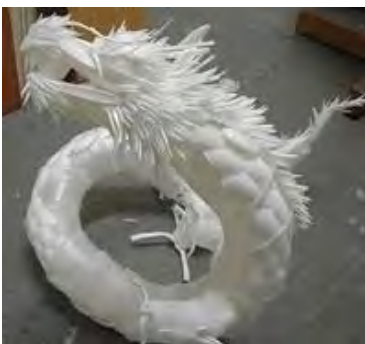
Use plastic junk... for surprising art!