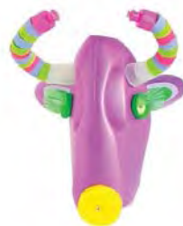
Use old jugs... for unusual masks!