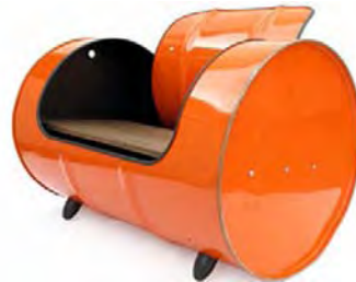
Use old containers ... for unique chairs!